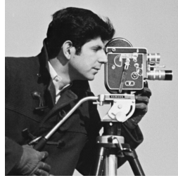
(a) Original image.