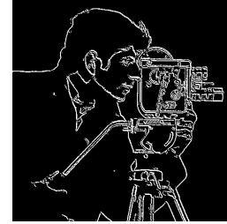
(b) Output image of the sobel algorithm.